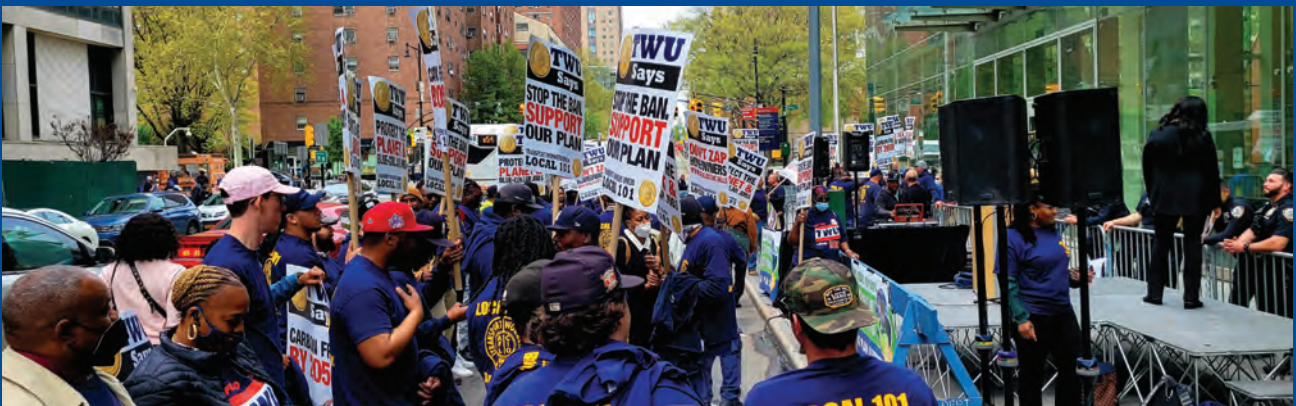
New Yorkers rally to support good, union jobs