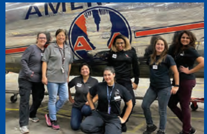
Women in Tech-Ops

After a two-year hiatus, the Aerospace Maintenance Competition (AMC) was back in action, April 25-28 in Dallas. TWU members from Locals 514, 567, & 591 participated, among the six teams sent by American Airlines, in a variety of aviation maintenance task-oriented challenges.