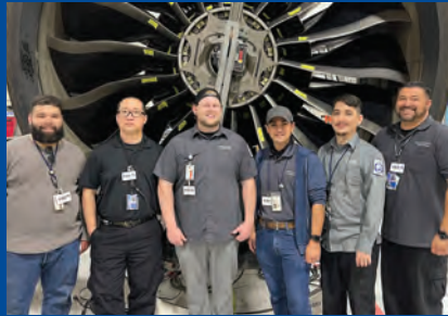
The LAX Crew