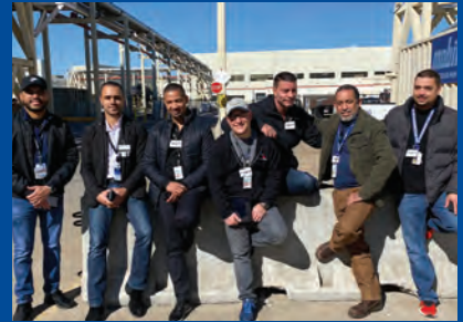
The MCT Tech Warriors