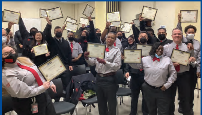
Graduates of the Spring 2022 SFMTA Training Program