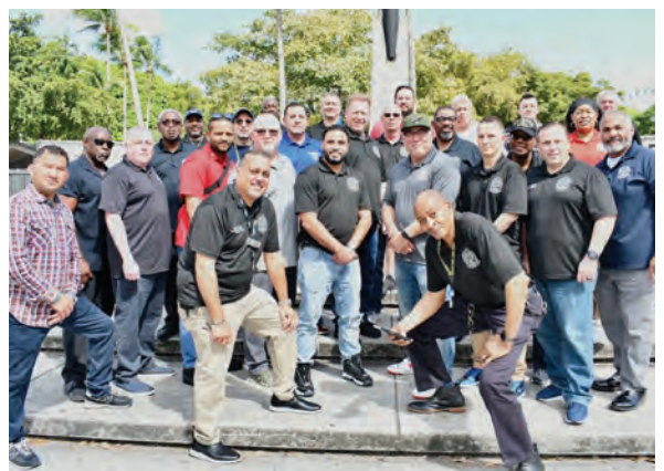
Members of the TWU Veteran's Committee