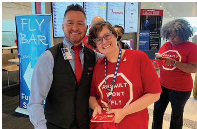
TWU members at a Day of Action promoting the Assault Won't Fly campaign at Dallas Love Field.