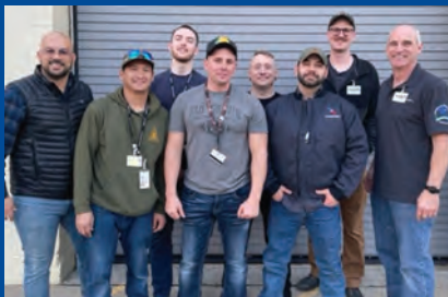
Team AA Chicago