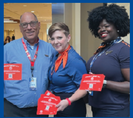
AIR / 14

Assault Won't Fly Campaign Goes to Florida