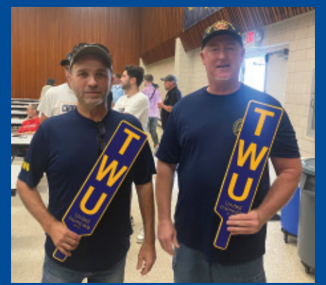
RAIL / 17

Assault Won't Fly Campaign Goes to Florida