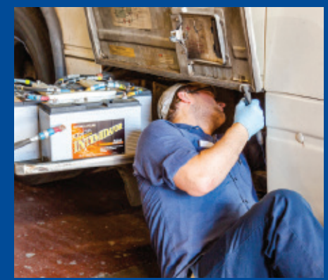
TRANSIT / 20