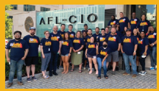
Attendees of the in-person OI training in front of AFL-CIO headquarters